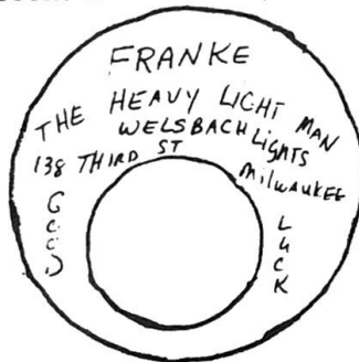
Round(Rd) Variety 2- off center in their encasement