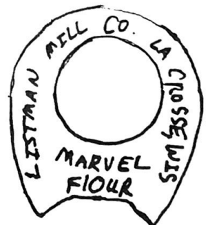
Horseshoe Var. 2-square bottom